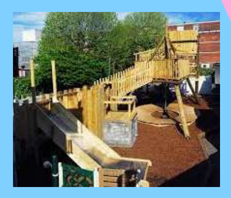
Notting Hill Adventure Playground W10 5YB 10.30am - 3.30pm