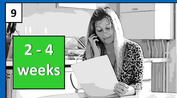
9 You will receive your result letter within a few weeks of your appointment