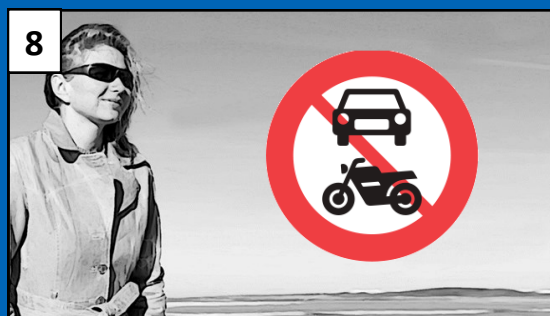
8 The drops make your eyes sensitive, so bring sunglasses and don't drive for up to 4 hours