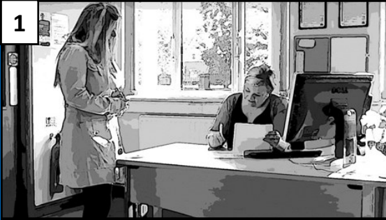
1 Make your way to the venue and let Reception know you have arrived