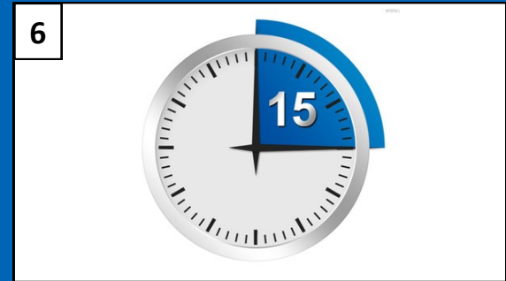
6 Return to the waiting room to let the drops dilate your eyes