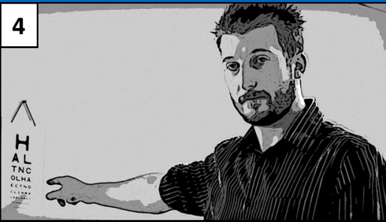
4 The Screener will ask you to read an eye chart