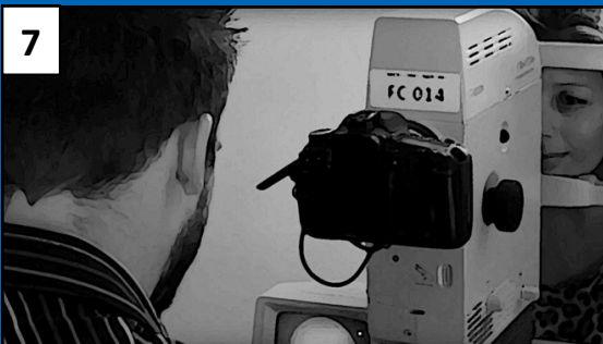
7 After 15-20 minutes, the Screener will take a photograph of the back of your eye (retina)