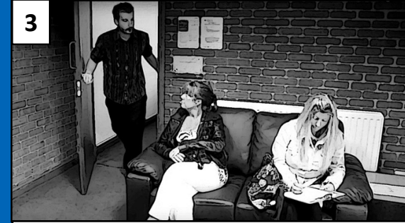
3 The Screener will come and collect you for your appointment